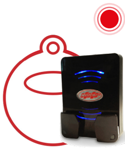
MIFARE READER LEGIC READER