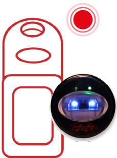
KEY READER KEY IR READER